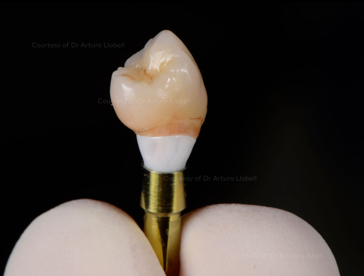
NobelProcera® crown FCZ with porcelain on NobelProcera® abutment