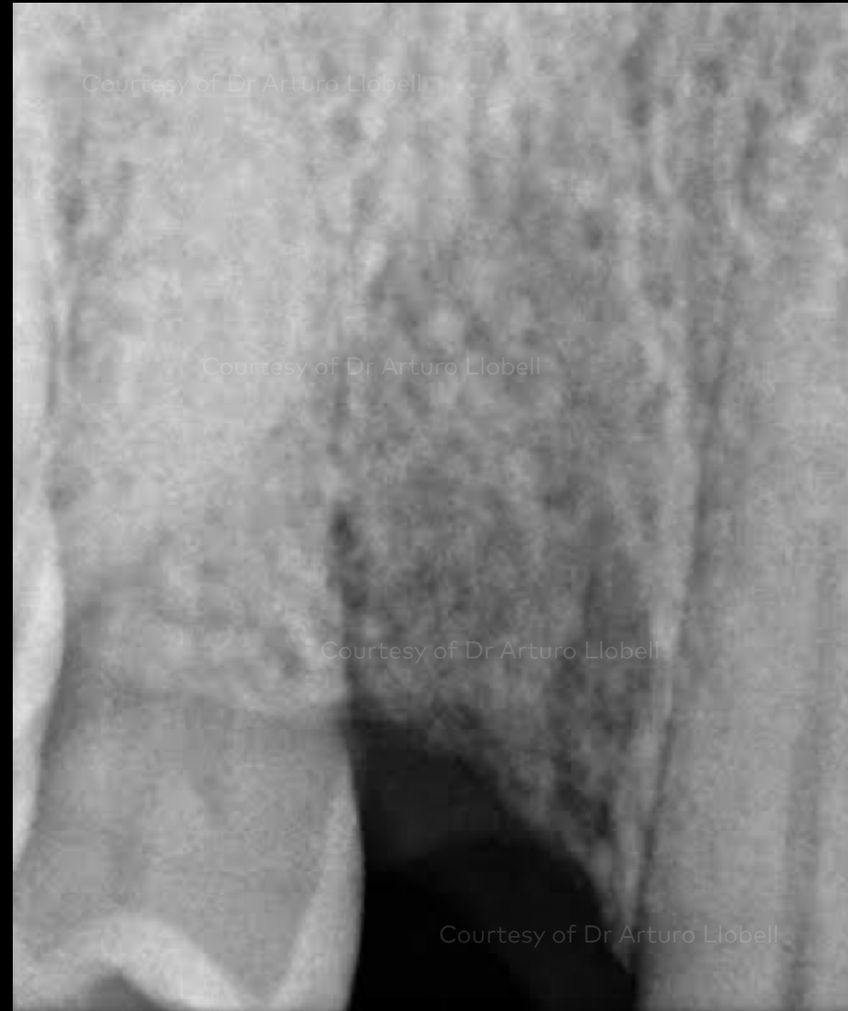
Panoramic X-ray taken before the surgery