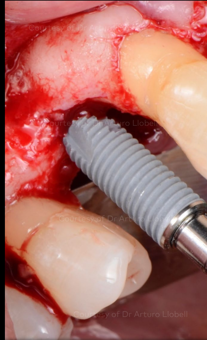
Placing the NobelParallel™ CC RP 4.3x11.5 implant. Insertion torque: 28 Ncm