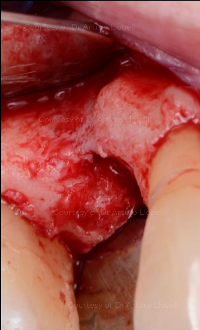
Surgical site with flap raised. Moderate bone quality is visible