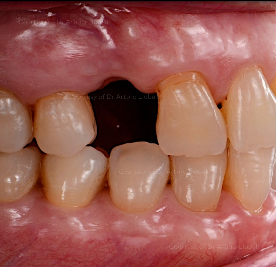
Healed site 14 with slight bone loss at position. Soft tissue recession on site 13 is not a concern for the patient