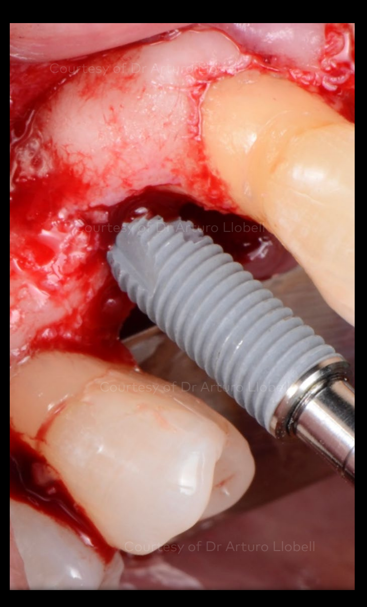
Placing the NobelParallel™ CC RP 4.3x11.5 implant. Insertion torque: 28 Ncm