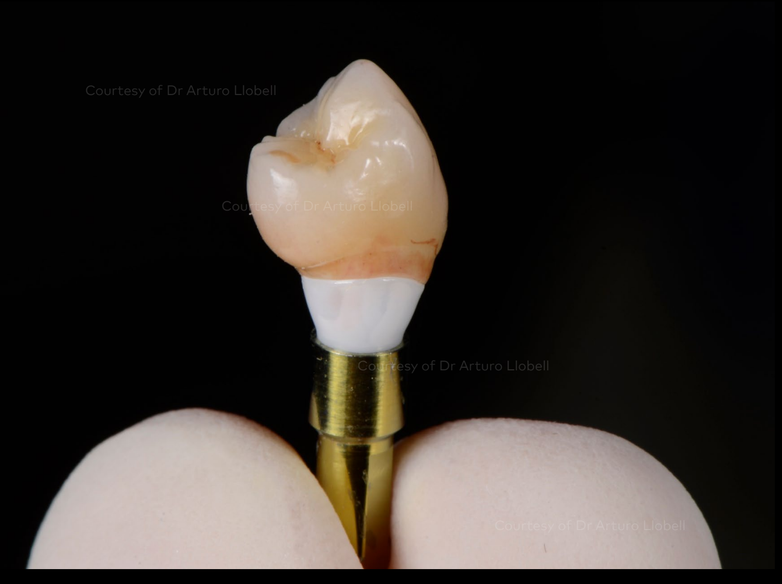
NobelProcera® crown FCZ with porcelain on NobelProcera® abutment