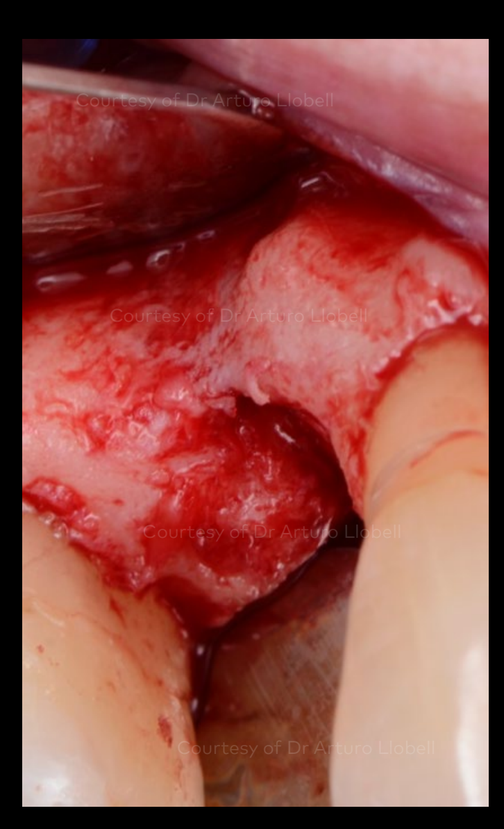
Surgical site with flap raised. Moderate bone quality is visible