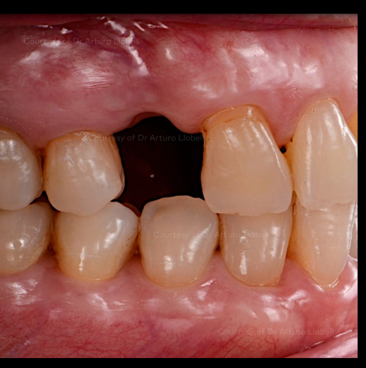
Healed site 14 with slight bone loss at position. Soft tissue recession on site 13 is not a concern for the patient