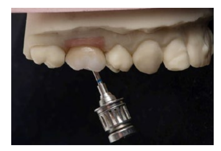
Final NobelProcera FCZ (full-contour zirconia) Implant Crown is received. The angulated screw channel allows for easy access with the Omnigrip Screwdriver