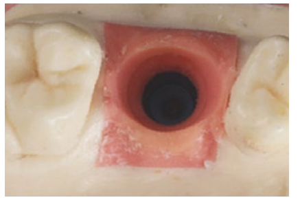
The master cast is created and the soft tissue on cast is trimmed to create the ideal emergence profile.