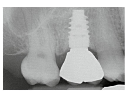
Final X-ray on day of crown placement. X-ray confirms optimal fit of NobelProcera FCZ Implant Crown.