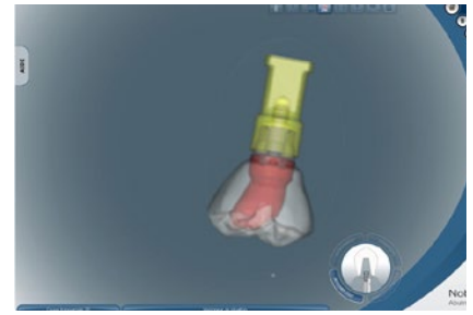
After scanning the wax-up (using the NobelProcera 2G Scanner), a molar crown is designed using the NobelProcera software.