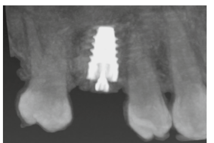
CT scan reconstruction in NobelClinician after implant placement (NobelActive 5.5 x 8.5 mm). Taken on day of surgery.