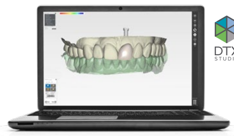
DTX Studio™ Lab software