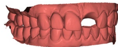
Visualization of the data acquired with an intraoral scanner

For more information see the NobelGuide concept manual.