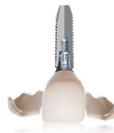
TempShell with Temporary Snap Abutment and Nobel Biocare implant