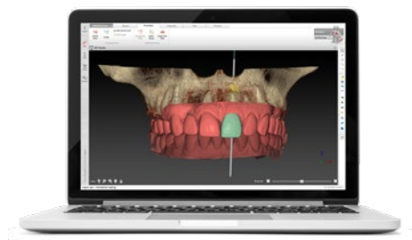
DTX Studio™ Implant

On the day of surgery, convert the TempShell into an individualized provisional restoration using Nobel Biocare's standard temporary abutments.