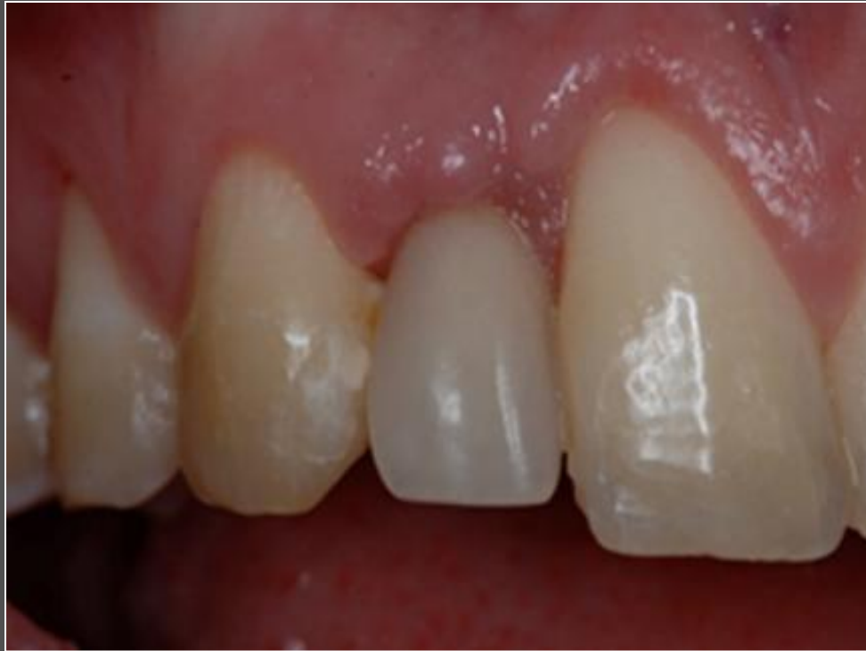
Temporary restoration after healing period.