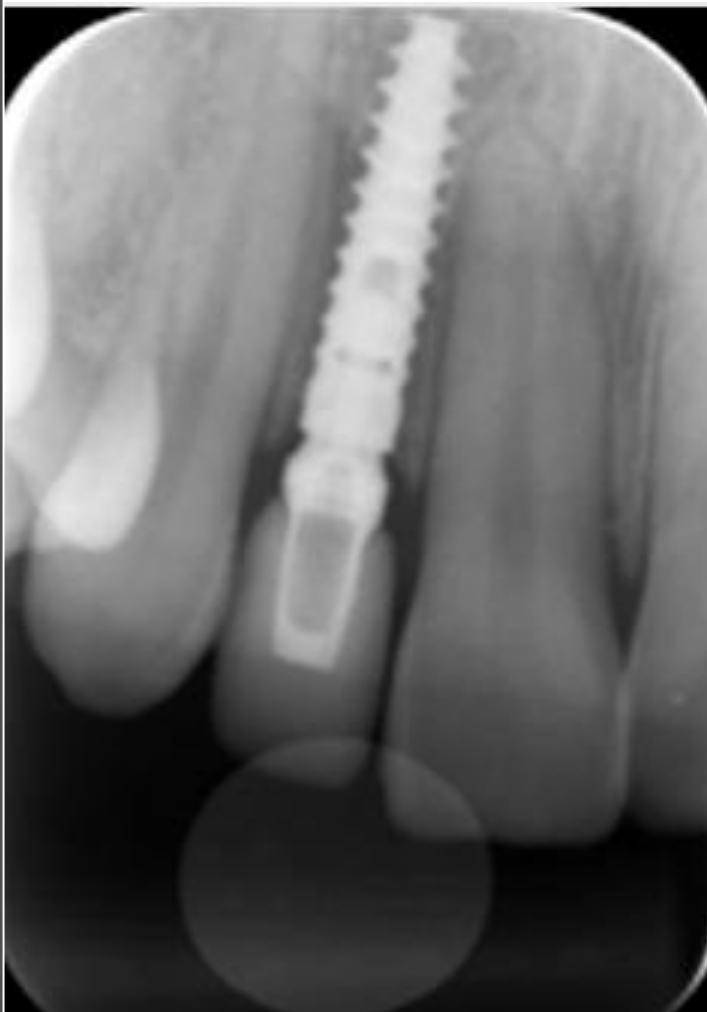
Radiograph: Implant insertion