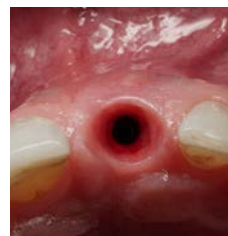
Soft tissue follow-up after immediate temporization