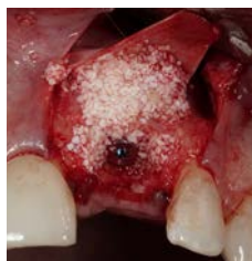
Grafting with creos™ xenogain