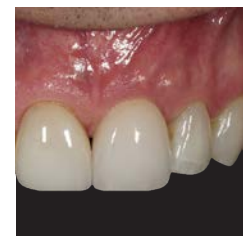
Final restoration with NobelProcera®