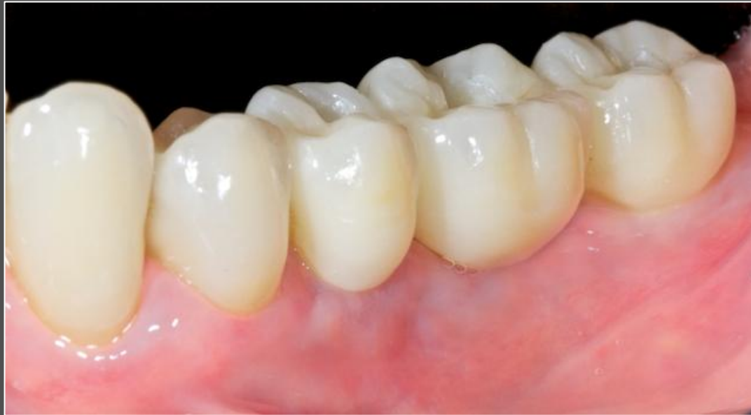
Definitive restoration on NobelReplace PS implants.