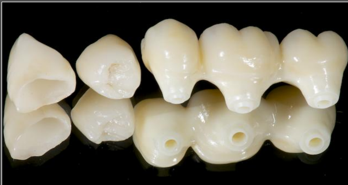
Procera implant bridge on implant level with 2 Procera crowns on teeth.